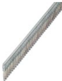
Plug-in bridge, pitch: 5.2 mm, number of positions: 50, color: gray

Please be informed that the data shown in this PDF Document is generated from our Online Catalog. Please find the complete data in the user's documentation. Our General Terms of Use for Downloads are valid ( http://phoenixcontact.com/download )